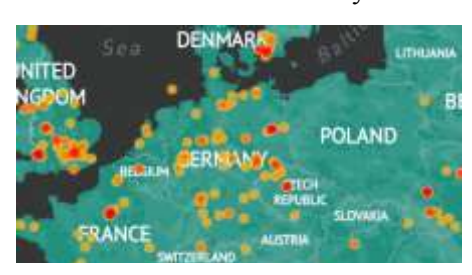
Poland - free from the Islamist attacks happening in other European countries

In November, President Duda was also present when the country's bishops proclaimed Christ as King of Poland in November last year.